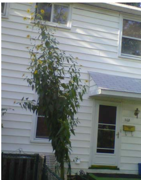
The Giant Northway Sunchoke “Waiting for Jack”

The new GHI member in 36 Court scratched his head at the fast-growing clump of plants; neighbors reported they had never seen anything like it. As it grew inches a day, some feared the clump might be the dreaded invasive bamboo rather than just a tall sunflower. But as its bright yellow but seedless flowers reached 12 feet, another possibility arose: the Jerusalem artichoke or “sunchoke” – a far cousin of the sunflower with no link with either Jerusalem or artichokes.