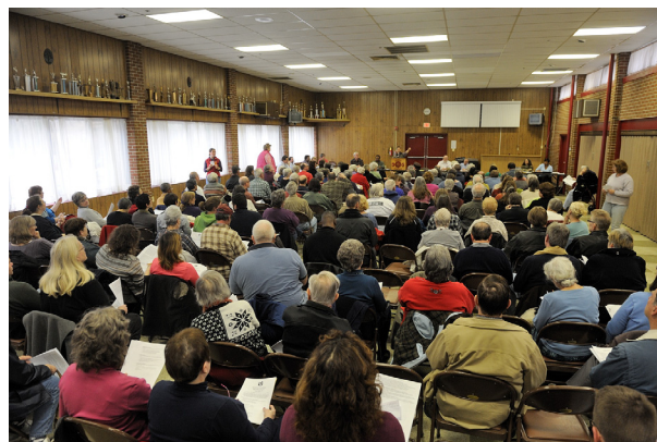
Nearly 200 members attended the Town Hall.

Thank you for your support during my 15 years as a GHI employee and for welcoming me to my new role as General Manager. Watch for future updates on GHI priorities and projects. I look forward to serving you in the years ahead, and your suggestions about ways to improve member service are always welcome.