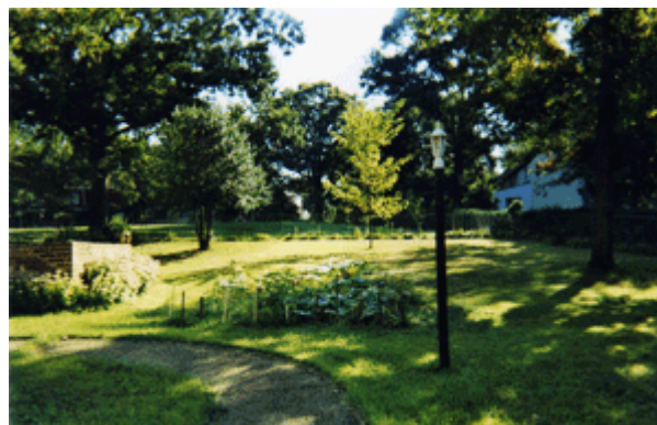
Gardening In Small Spaces

Get more sleep; turn off the TV/ computer/ cell-phone; reconnect with old acquaintances (and be nice when they reconnect with you); call Mom; read aloud; smile; eat, drink, and be merry ( Ecclesiastes viii.15 )! Seize the day (Horace, Odes 1.11 )! Accentuate the positive (Johnny Mercer)!